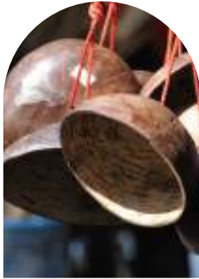
COCONUT SHELL BOWL PAINTING