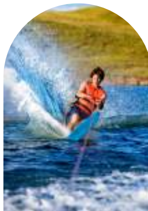
WATER SKI/WAKE BOARD