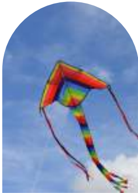
TRADITIONAL KITE MAKING

Whether it's the rich local culture or natural environments, explore the best that Lang Co's vicinity has to offer.