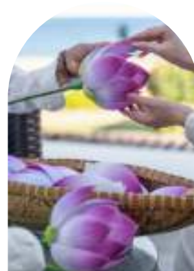
LOTUS PAPER MAKING