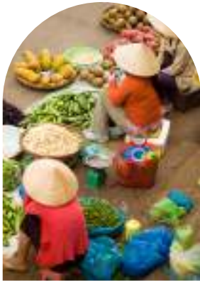
LOCAL MARKET EXPERIENCE

Whether it's the rich local culture or natural environments, explore the best that Lang Co's vicinity has to offer.