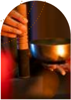
SINGING BOWL THERAPY