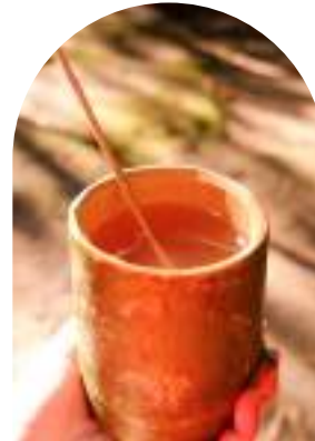
BAMBOO CUP PAINTING