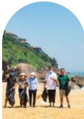
BEACH CLEANING UP