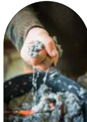
RECYCLED PAPER MAKING