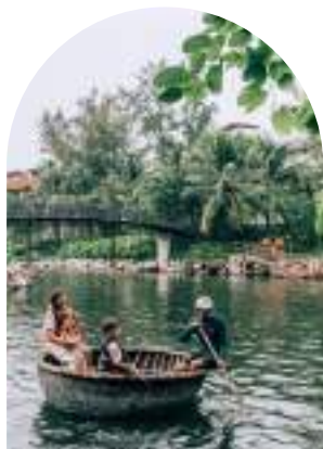
VIETNAMESE BASKET BOAT

Feel the thrill as you race through the waters on a jet ski, ride the waves on a wakeboard or enjoy a heart-thumping ride on the all-time favourite banana boat designed for families.