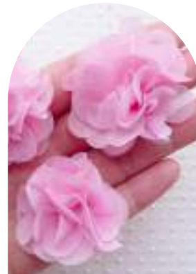
CHIFFON FLOWER MAKING