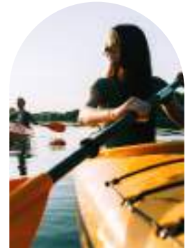
KAYAK/STANDUP PADDLE BOARD SAFARI

All watersport activities are subject to weather conditions and subject to change or cancellation. For more information, please contact our Reception Desk.