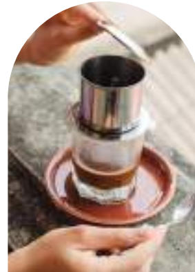
HOW TO MAKE VIETNAMESE COFFEE