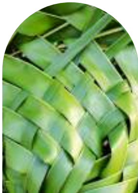
COCONUT LEAF FOLDING