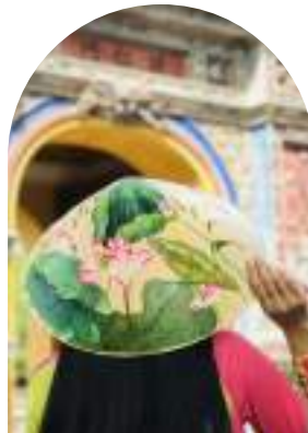
CONICAL HAT PAINTING