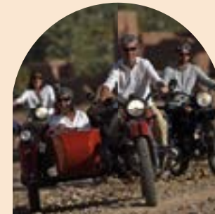
66 A road trip with SideCar, in Marrakech or in the desert, spectacular.