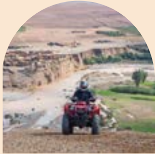
62 Sunset over the Agafay desert, (or camel ride, or quad bike ride...)