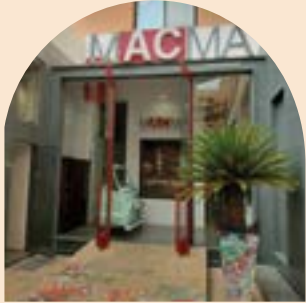
61 The MACMA Museum of Art and Culture