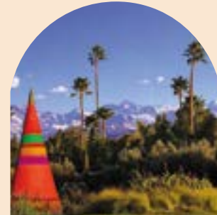
65 Anima garden