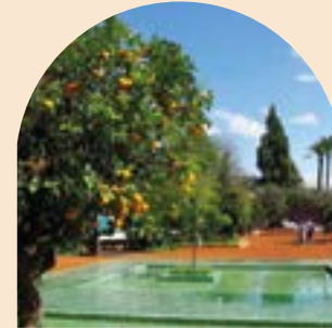
68 Arsat Moulay Abdeslam Cyber Park, a peaceful break from the hustle and bustle.