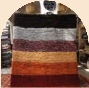
63 Tamesloht art and weaving cooperative